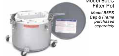
Model 60LC Filter Pot Model B6PS Bag & Frame purchased separately

For filtering and safer handling of hot oil Low profile to fit under drain valves