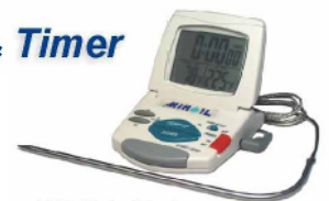
MTT Digital Frying Thermometer & Timer